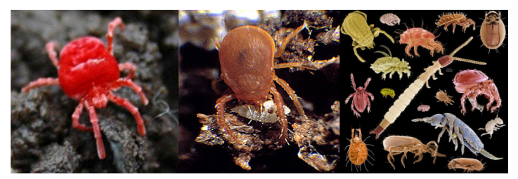
Figure 2.9 of soil micro-arthropods from EEA report on soil health and soil biodiversity from Soil biodiversity: functions, threats and tools for policy makers , European Commission Directorate General of Environment (2010).

in soil, since the earthworm is near the end of the soil feeding chain, policy and soil health building practices also need to protect such microfauna soil builders as these: