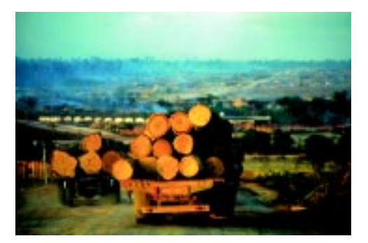
Loggers transport timber to one of the 200 sawmills in Paragominas