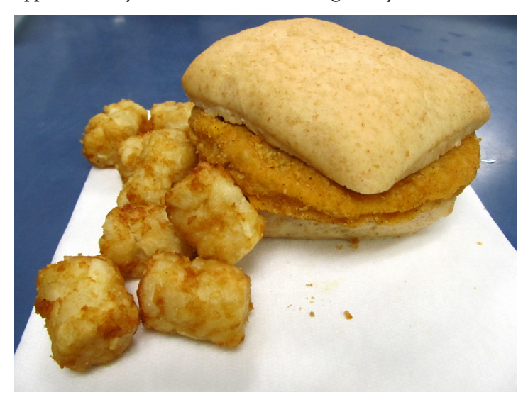
A chicken patty on a 51 percent whole grain bun

The state Legislature passed legislation to formally create the Alaska Farm to School program in 2010.2 This included the appropriation of $3 million to the Nutritional Alaskan Foods in Schools pilot program both in Fiscal Years 2013 and 2014. The funding provides reimbursements3 to individual school districts for the procurement of a wide variety of Alaska Grown and raised products including finfish, shellfish, livestock, milk, fruits, vegetables, native produce and berries that are commercially harvested, poultry and grains. The Fairbanks North Star Borough School District was allocated approximately $208,000 of this funding each year.