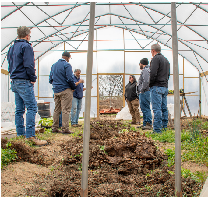
NRCS chief and local farmers in EQIP-funded high tunnel on farm near St. Louis.

Farmers have convinced Congress of how useful EQIP and CSP are for them and their land. In 2022, not only did Congressional Democrats pass the IRA with increased funding for these programs, but they also removed the requirement (within the IRA's funds) that 50% of EQIP dollars go toward livestock-related practices. This was a major win, as the livestock set-aside finances expensive, large-scale, industrial practices, such as manure lagoons, leaving fewer dollars available for smaller and more sustainable operations. The 50% requirement is nationwide, and states are encouraged to dedicate 50% of their allocation to