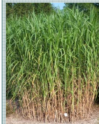
Miscanthus giganteus

Miscanthus is a grass native to Asia also known as elephant grass. It can reach 15 feet tall and produce immense biomass. For this reason, it is a promising bioenergy crop.