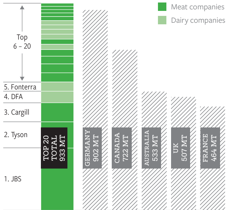
Figure 2. The top 20 meat (beef, pork, poultry) and dairy companies combined emit more greenhouse gases than Germany, Canada, Australia, the UK or France.

Just 20 transnational companies combined emit more GHGs than several industrialized countries (Figure 2). Just five combined emitted more GHGs in 2016 than Shell or Exxon or BP and yet none are legally required to report, verify or reduce their emissions.