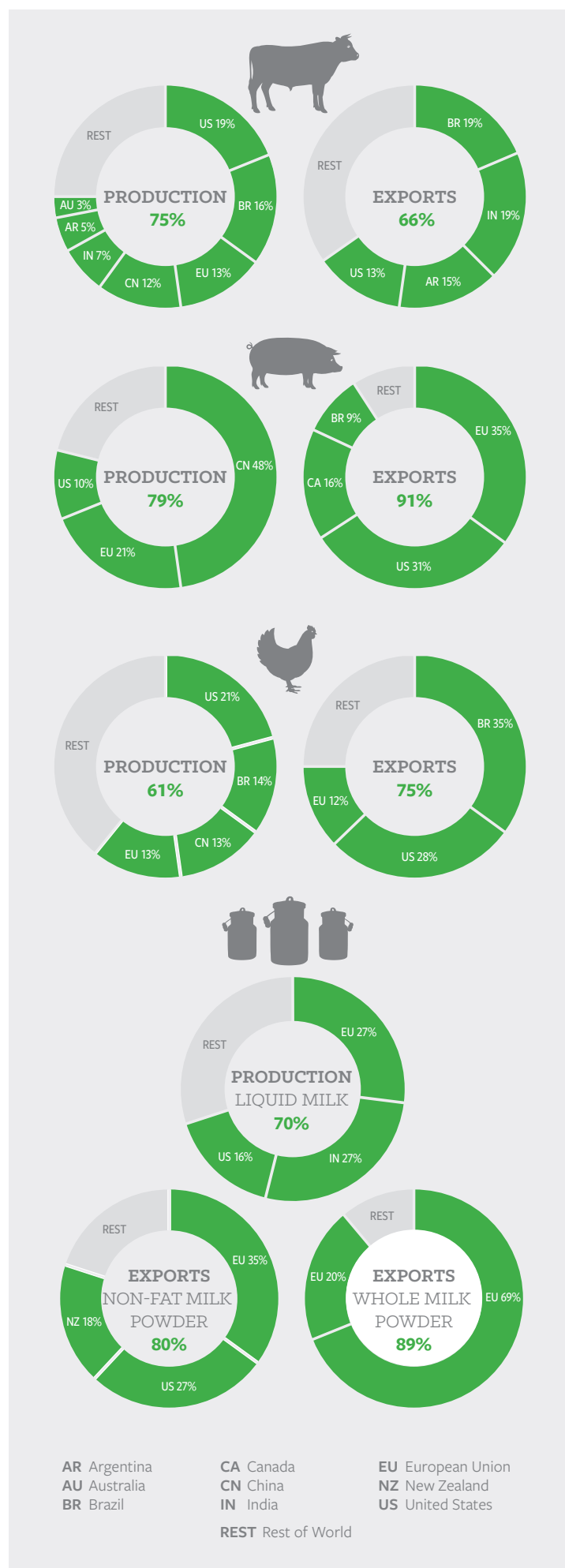
Figure 1. Surplus producers and exporters of meat and dairy; modified from Climate Land use Rights Alliance (CLARA) 2018. Missing Pathways to 1.5°C . 19

Similarly, the U.S. Farm Bill heavily subsidizes cheap, often below cost feed (corn and soy) that supply mega factory farms associated with widespread rural water and air pollution—often in African American and Latino communities. The expansion in factory farms, and loss of smaller, independent producers, is largely responsible for the steady increase in U.S.-based agriculture-related GHG emissions 8 . In Brazil, the situation is even more dire. Between 2010 and 2020, 50 million hectares of forest in the Amazon (the size of Spain) will have been cut down despite voluntary pledges made by major consumer brands to achieve net-zero deforestation by 2020. 9 The devastating fires that are ravaging the Amazon and the Chaco are, in part, the result of land degradation hastened by transnational livestock and feed grain conglomerates 10 . Meanwhile, China's transnationals such as the world's largest pork producer, WH Group and grain trader COFCO, continue to be heavily subsidized by the government 11 . If governments are serious about “nature-based solutions” promoted at the Climate Action Summit, these public handouts must stop and be redirected towards regenerative agriculture.