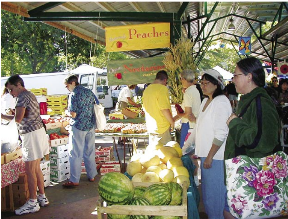
To encourage produce consumption among low-income consumers, the USDA could expand its Farmers' Market Nutrition Program, which provides $20 million in coupons annually to low-income and elderly persons for farmers' market purchases. Left , shoppers at the popular Davis Farmers Market.

probably have to be designed to minimize impacts to existing food assistance programs, depending on commodity distribution. For example, some commodities that currently qualify for direct payments — which eventually make their way to entities such as food banks and schools through FNS food distribution programs — could be negatively affected by a reduction in commodity availability and price.