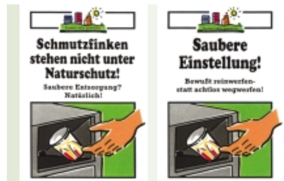
McDonald's Germany's posters encourage customers to clean up and not litter. Slogans include: "Have a clean attitude" and "Litter bugs are an endangered species."

To encourage environmental awareness and protection, McDonald's Japan has created a "Thank You Box" to separate their litter. It includes clearly identified illustrations so customers can separate and dispose of plastic garbage, trash other than plastic, and beverages with ice.