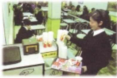
McDonald's Korea, in partnership with a major paper pulp supplier, collects and recycles paper cups from our restaurants, which are recycled into tissue products and supplied to McDonald's.