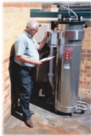
With Australia being the driest continent on Earth, McDonald's Australia has invested in technology to improve the quality of waste water from restaurant operations. Along with in-store procedures to reduce the amount of material getting into drains, there has been an improvement of approximately 90 percent in waste water quality in those stores.

The average water use of a McDonald's restaurant is 10 to 15 cubic meters (2,600 to 4,000 gallons) of water per day. Typically, 20 percent of the water is used for purposes such as drinks and watering the landscape, while 80 percent of the water leaves through the waste drains.