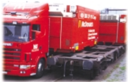
McDonald's Switzerland has developed ways to increase the proportion of combined rail transportation and direct transfer of

We are exploring ways to improve distribution efficiencies and reduce the impacts of transportation, especially related to energy use and other infrastructure effects. McDonald's works with independent companies that are, in many cases, dedicated to distributing food and paper goods to our restaurants and supporting the McDonald's system. Regional distribution centers service an average of 200 to 300 restaurants each.