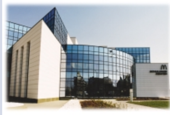
Originally begun in the basement of a McDonald's restaurant in 1961 (shown in top picture); HU currently translates curriculum materials into 28 languages and provides live simultaneous interpretation of as many as six languages during course sessions. Campuses exist in Australia, Brazil, Germany (pictured above), Hong Kong and the United Kingdom.