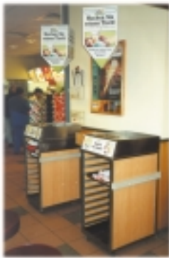
McDonald's Germany has an in-store recycling collection system. Customer waste is brought to these tray carts, which includes a separate place for draining liquids.